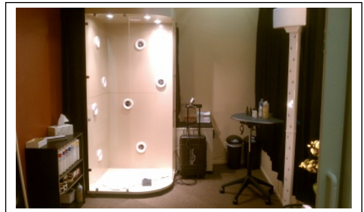
Body Dryer in Tanning Room with Negative Air Chamber in Napa, CA

"The fan we used to use took forever and customers complained of being cold. Now, they dry quickly, evenly and warmly, and rave about the dryer".